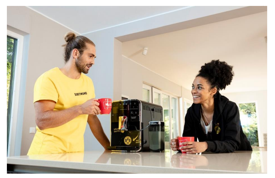
Image 3: Fans can also enjoy first-class coffee at home with a fully automatic coffee machine (Barista TS Smart) in the team's colours.