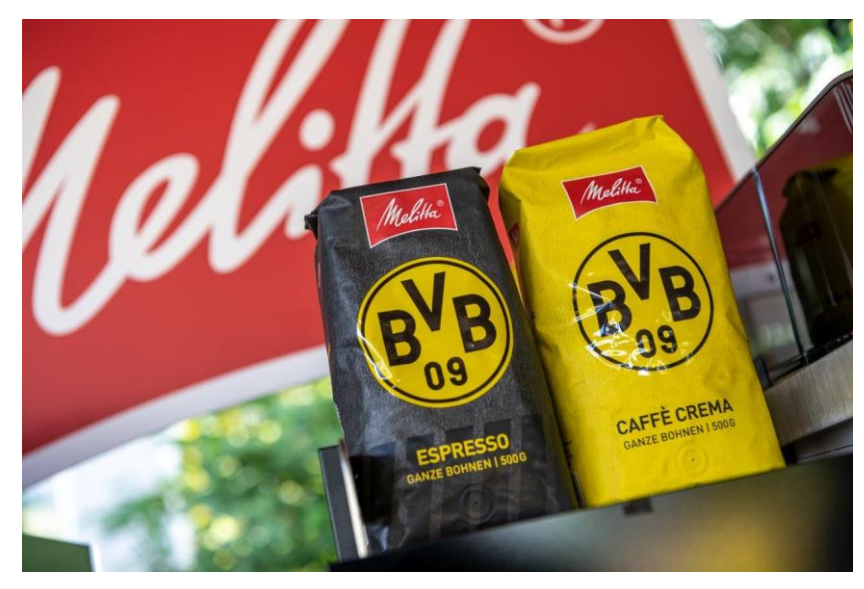
Image 2: A range of co-branded products was created in the course of the partnership (see above BVB coffee in Espresso and Café Crema versions).