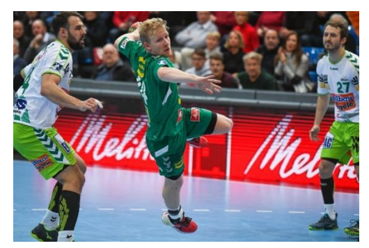
Image 6: Melitta has supported GWD Minden since 1964.