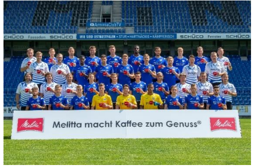
Image 5: In 2018 Melitta joined the East Westphalia Alliance and supports Arminia Bielefeld with their fresh start.