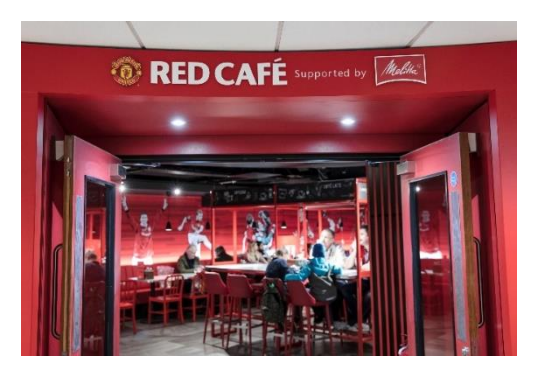
Image 2: Melitta provides spectators at Old Trafford including at the 'Red Café supported by Melitta' with coffee specialties.