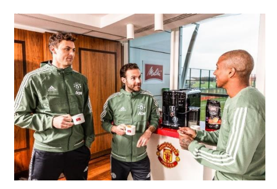
Image 1: Melitta has been a partner of the traditional English club Manchester United since 2017.