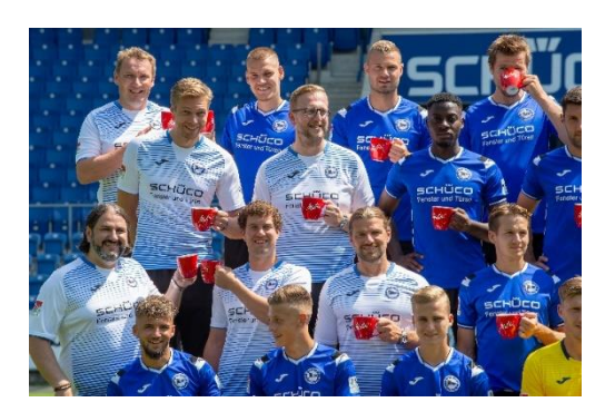
Image 4: In 2018 Melitta joined the East Westphalia Alliance and supports Arminia Bielefeld with their fresh start.