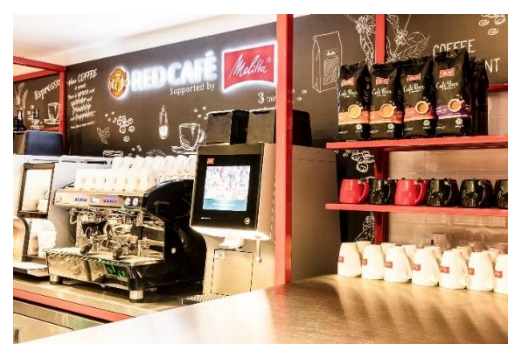
Image 3: Melitta provides spectators at Old Trafford including at the 'Red Café supported by Melitta' with coffee specialties.