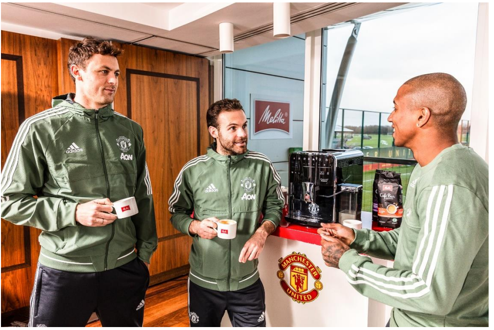
Melitta has been a partner of the traditional English club Manchester United since 2017.

Melitta Sport sponsoring: Strong emotions and very special moments